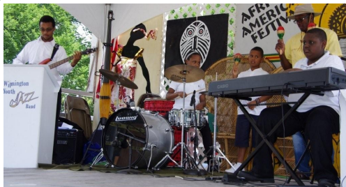
African Festival, 2011