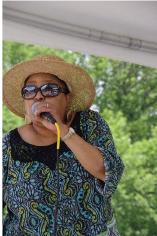
African Festival in Dover, DE June 25, 2011

Founder/Executive director and Director of the band